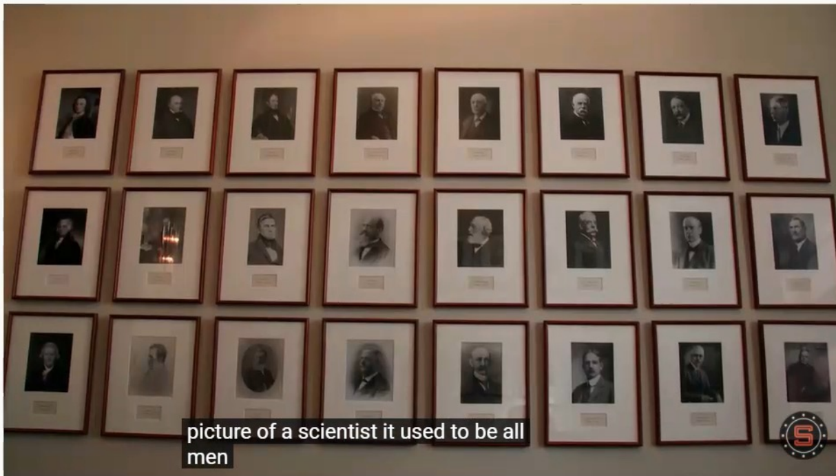
picture of a scientist it used to be all men