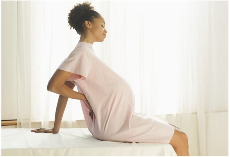
Structural Racism as a Root Cause of America's Black Maternal Health Crisis