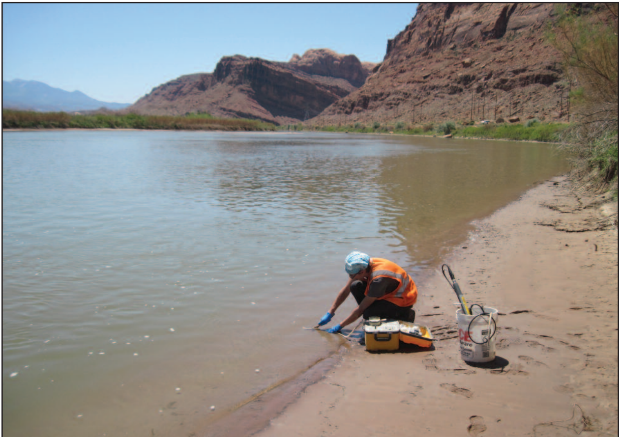
Surface water sampling of the Colorado River main channel downstream of the Moab site.