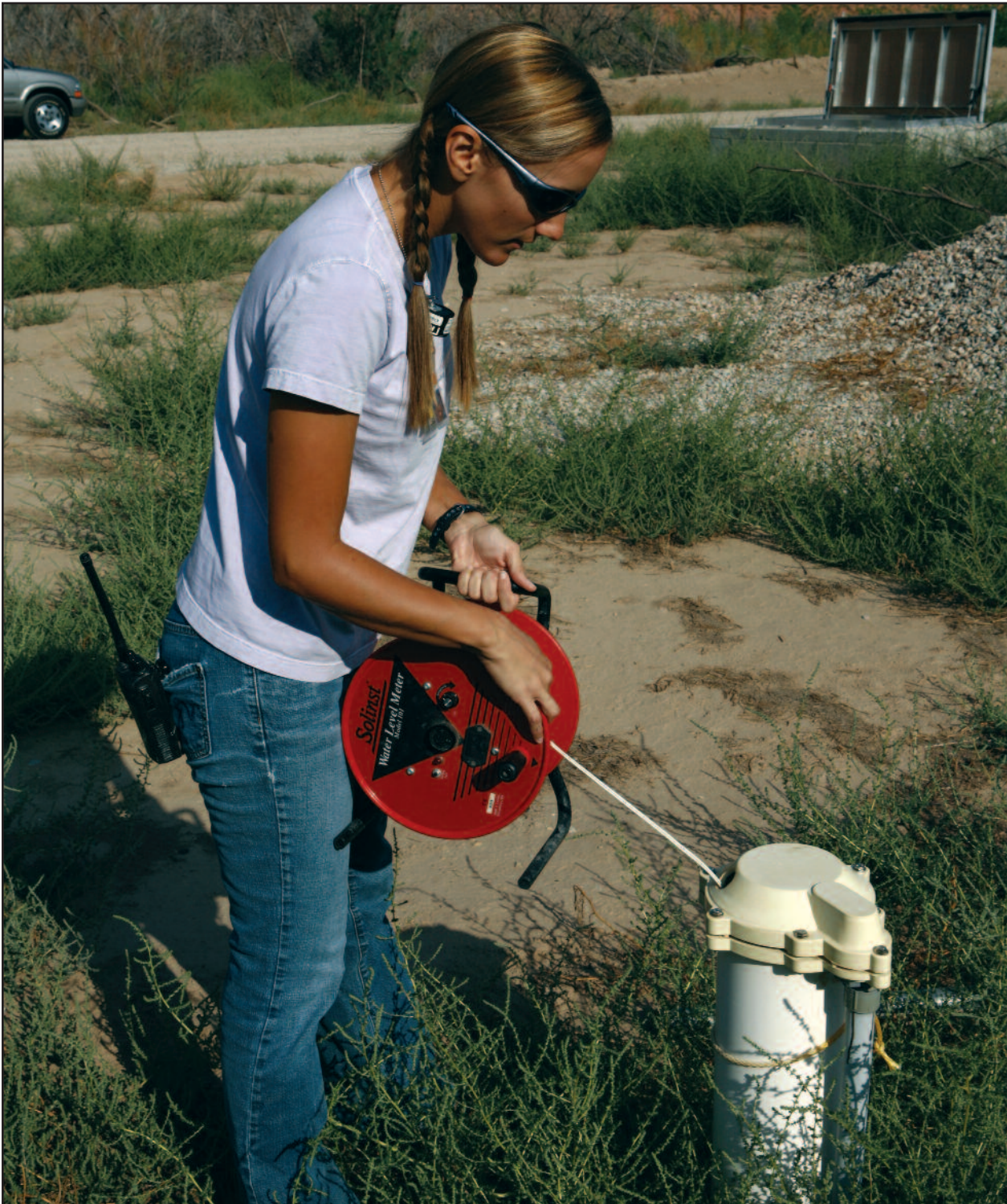
Measurement of water levels in the well field at the Moab site.

implementing an interim action system that currently includes eight extraction wells and more than 30 freshwater injection wells. The system is designed to protect surface water quality and to recover ammonia, uranium, and other contaminants prior to discharge to the Colorado River. Injection of filtered freshwater into the subsurface creates a hydraulic barrier between the ammonia plume and backwater channels of the river, which serve as suitable habitat for young fish.