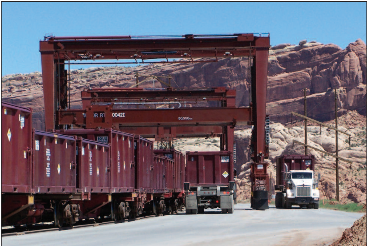
A gantry crane loads and unloads containers to and from railcars.