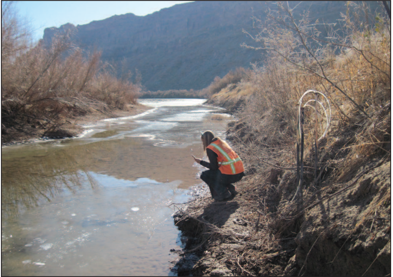
Surface water sampling of the Colorado River backwater channel adjacent to the Moab site.