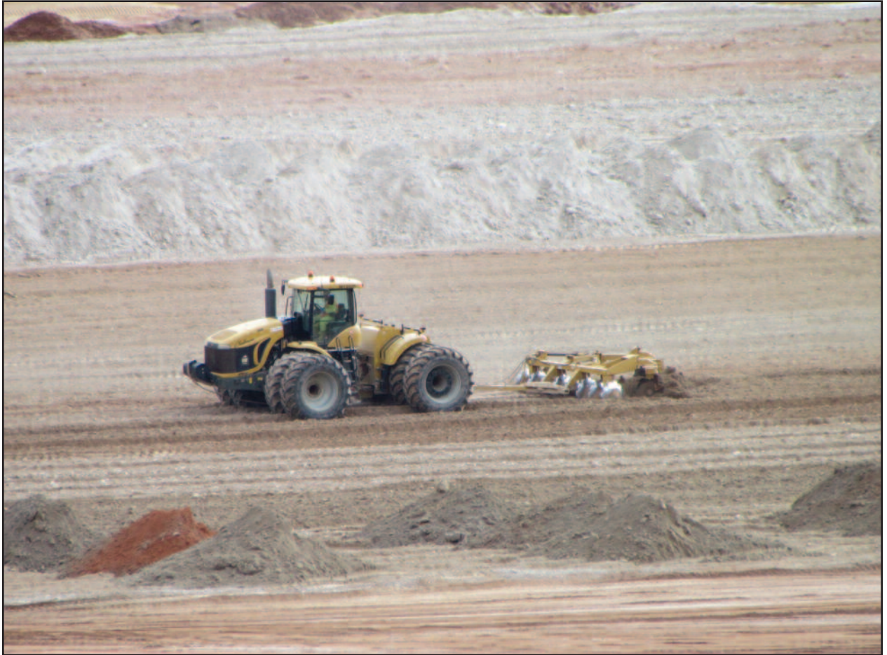
A dicer turns over wet tailings at the Moab site.