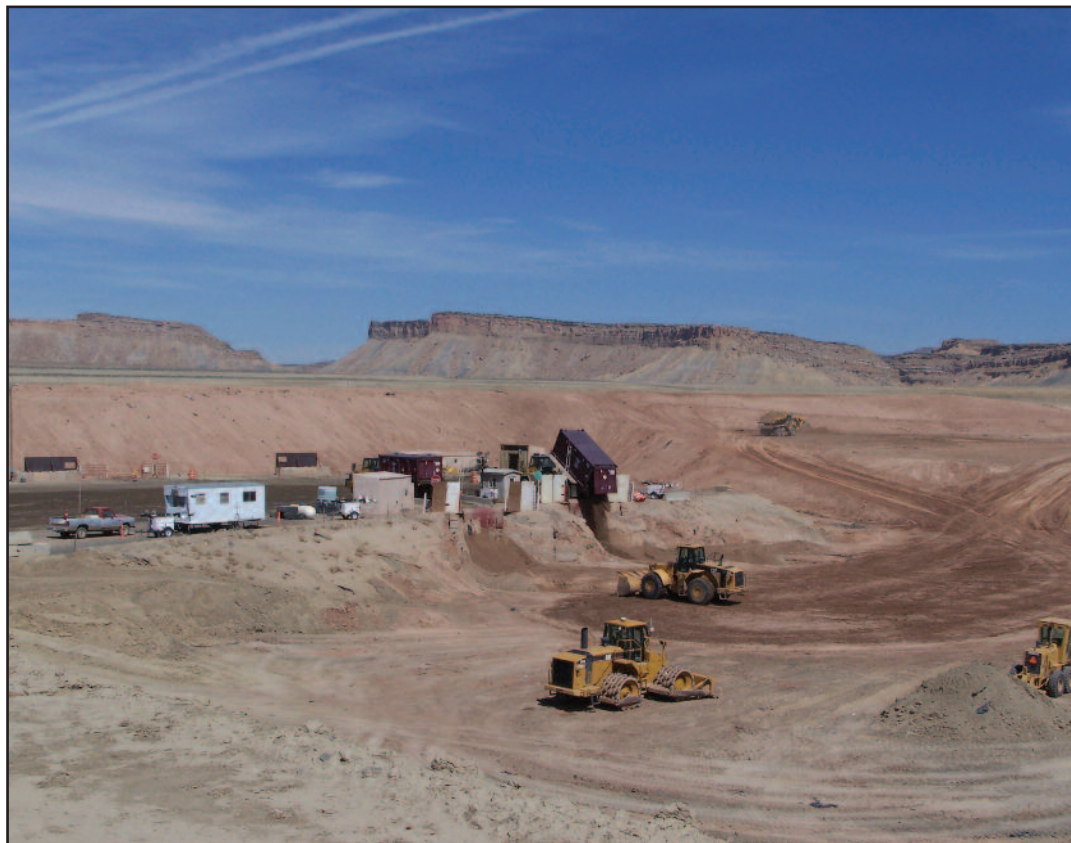
Tailings are end-dumped from a container into the Crescent Junction disposal cell.

Prior to DOE site ownership, no efforts were made to prevent contaminated groundwater from directly discharging to the Colorado River. Primary contaminants include ammonia and uranium. In 2003, the DOE began