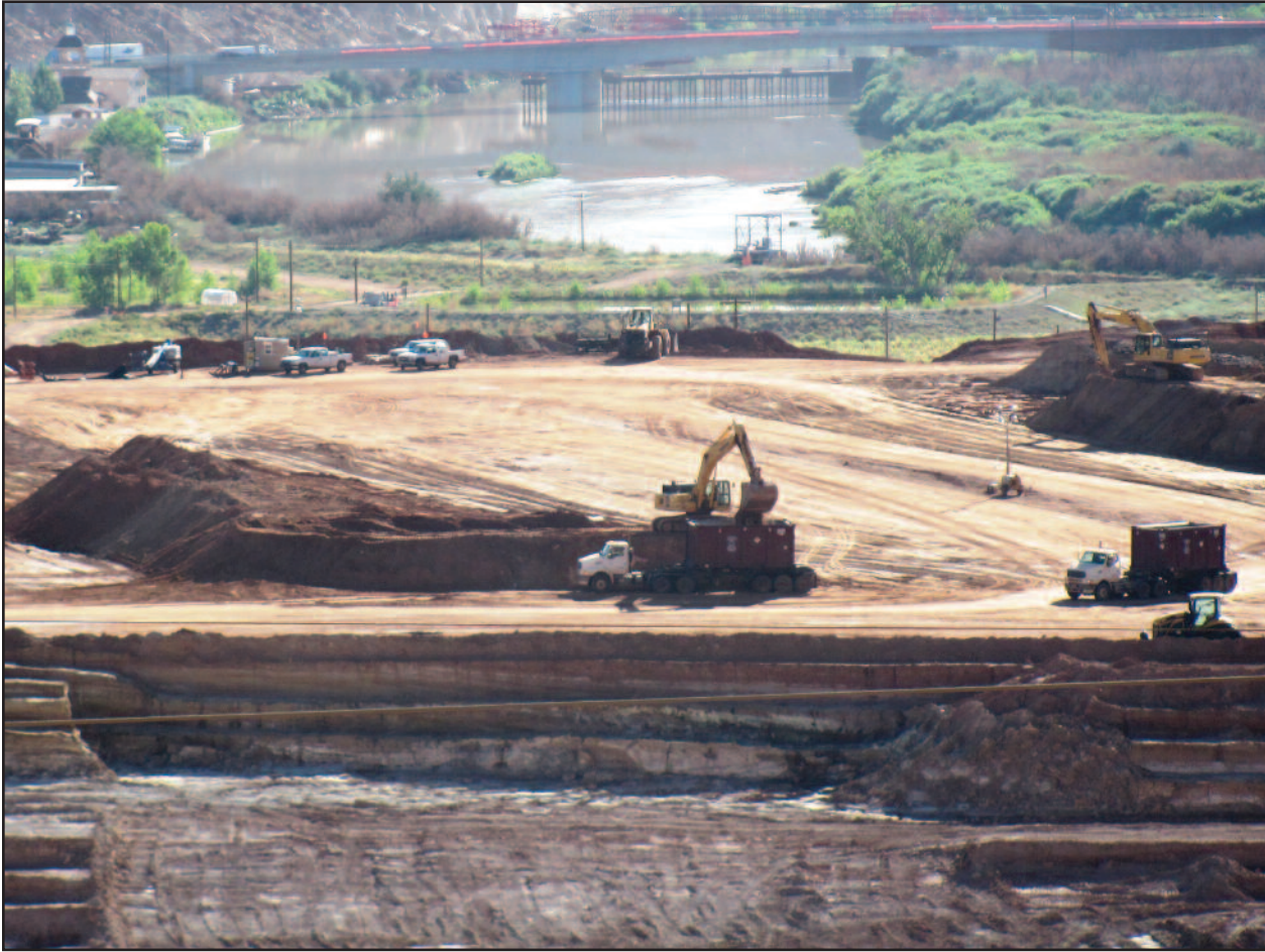
Conditioned tailings are loaded into a container for shipment.

Currently each train is up to 35 railcars long, and each railcar holds four tailings containers. As of early August, the project has shipped and disposed of a total of more than 5.4 million tons.