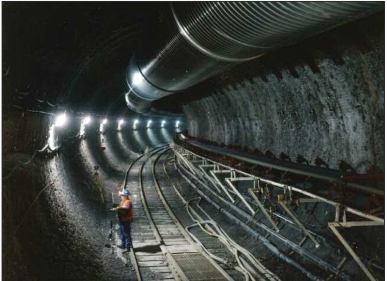
View of the first curve of the main drift at Yucca Mountain. If the project is truly dead, it is hoped that lessons learned over the years can benefit future waste disposal projects.

for this technology is estimated to be about $40/MW, which puts the $1/MWh nuclear waste fee clearly at an advantage.