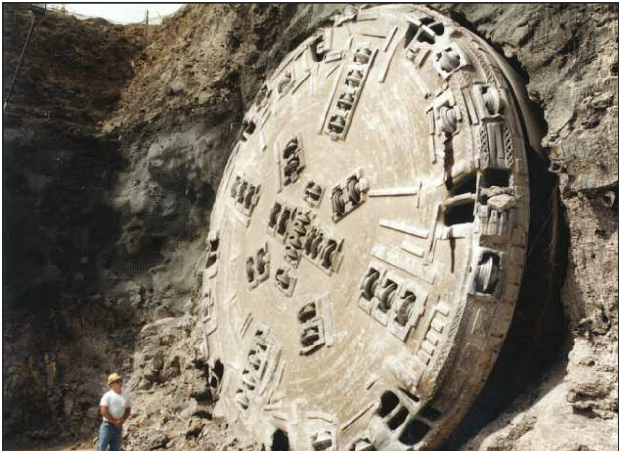
It was a big day for the Yucca Mountain project when the tunnel boring machine reached daylight in April 1997. Today, the machine sits abandoned at the Yucca Mountain site.

list. (Which is why, to this day, this legislation is referred to in Nevada as the "Screw Nevada" Bill.) The legislation also, among other things, ended the second repository screening program and prohibited studies of repository sites in granite. The nuances of the original legislation had been effectively crushed by political considerations. Fu-