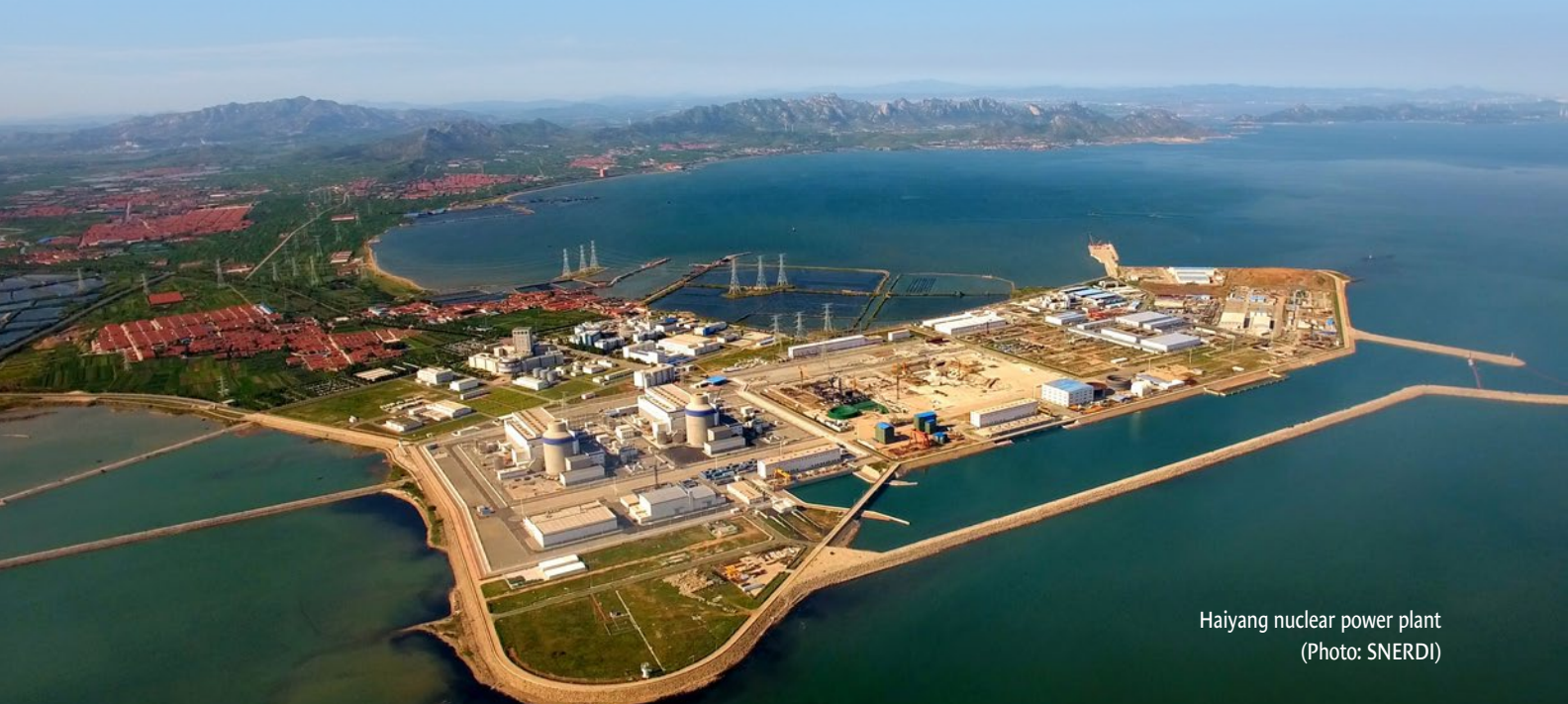
Haiyang nuclear power plant

In addition to developing advanced PWRs, China also continues to strengthen R&D support for multi-application small modular reactors, molten salt reactors, and fast reactors and is actively carrying out commercial reactor demonstration. Application of nuclear energy in China is changing from simply generating electric power to versatile applications, including district heating, process heat, desalination, hydrogen generation, and so on. On November 9, 2021, Haiyang in Shandong Province became the first city in China to achieve net zero carbon in district heating, as it is fully heated by warm water from the heat exchangers installed downstream of the high-pressure turbine of the Haiyang nuclear power plant.