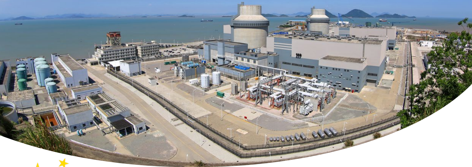
Sanmen nuclear power plant