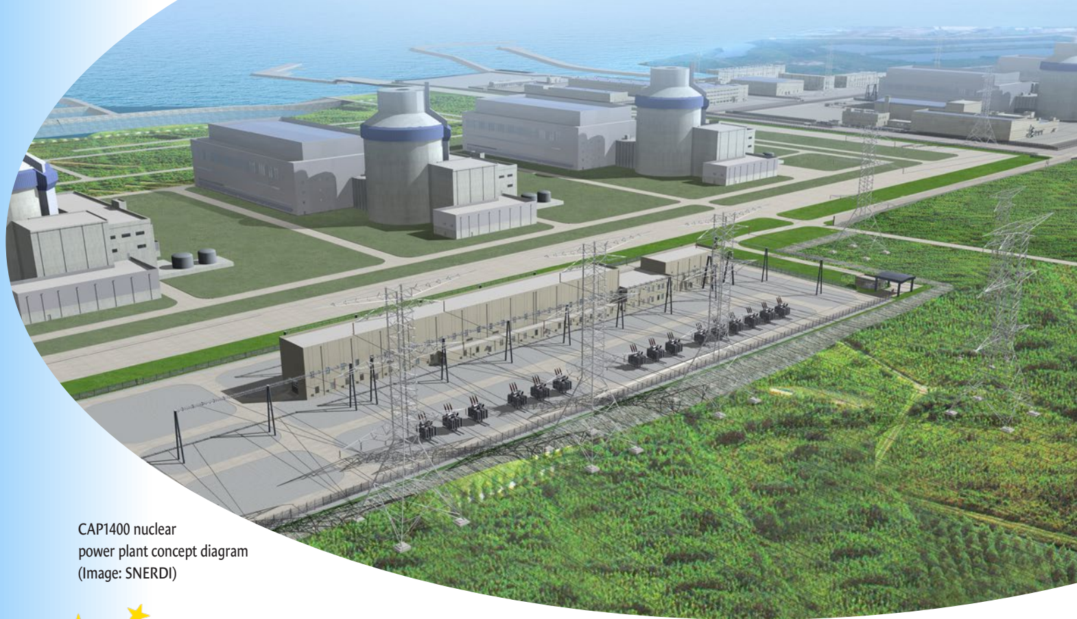
CAP1400 nuclear power plant concept diagram