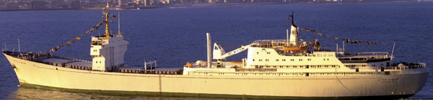
NS Otto Hahn near Cape Town, South Africa.

In addition to the Otto Hahn , two other nuclear-powered cargo ships are historically notable: Japan's Mutsu and Russia's Sevmorput . The Mutsu was a 36-MWt 32 fuel assembly PWR that was launched and began testing at sea in 1974. A shielding design deficiency resulted in high neutron radiation dose, which, along with negative public reaction, resulted in subsequent redesign, modification, and eventual decommissioning in 1992. The Sevmorput is a currently operating cargo container ship powered by a 135-MWt four-loop PWR. It is designed to carry up to 1,328 containers and is qualified to travel through the sea with ice present. It began operation in 1988 but was laid up for several years due to light demand for its services, and the possibility of converting the ship for other purposes was considered. Finally, after refitting and refueling, it returned to its cargo mission in 2016.