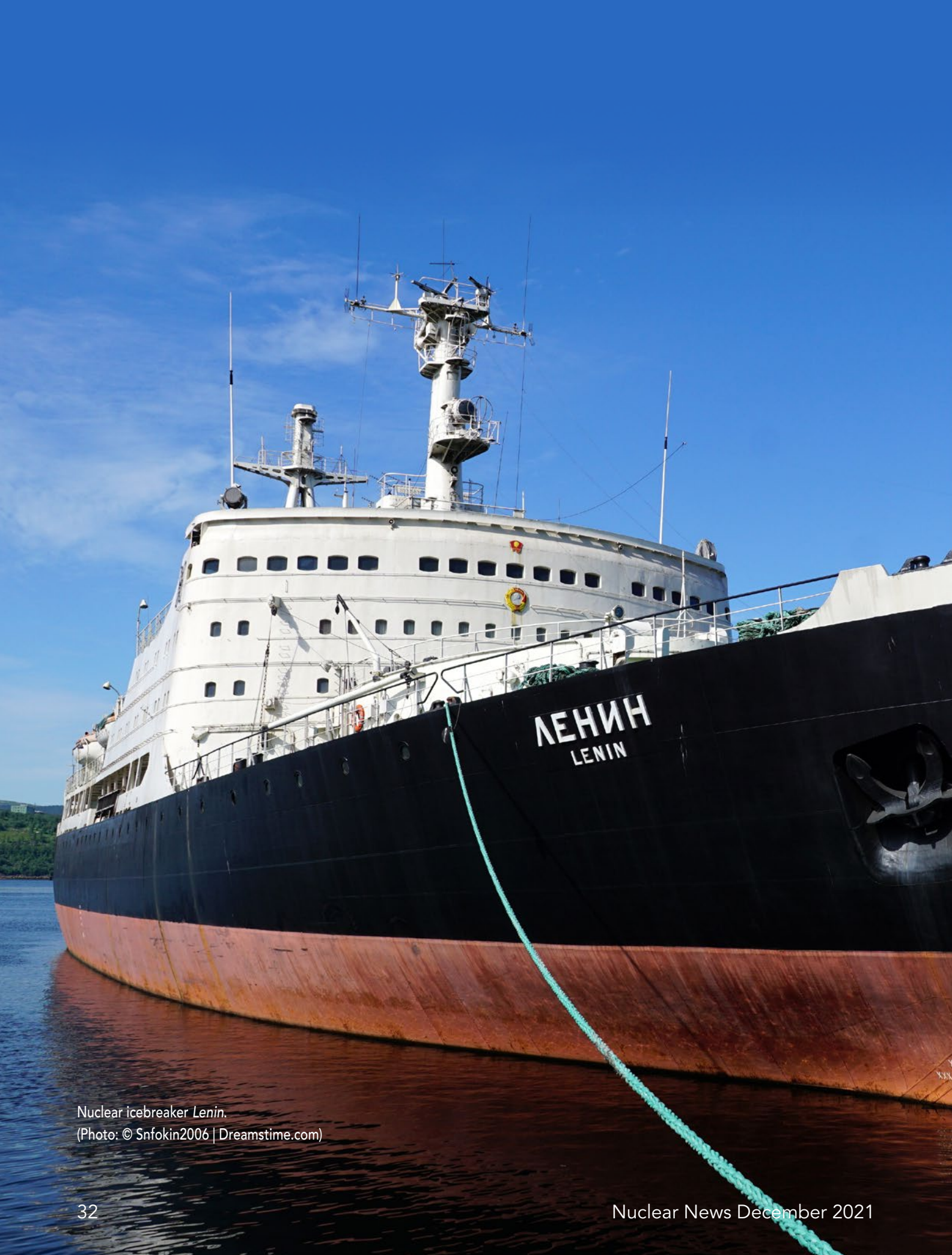
Nuclear icebreaker Lenin .