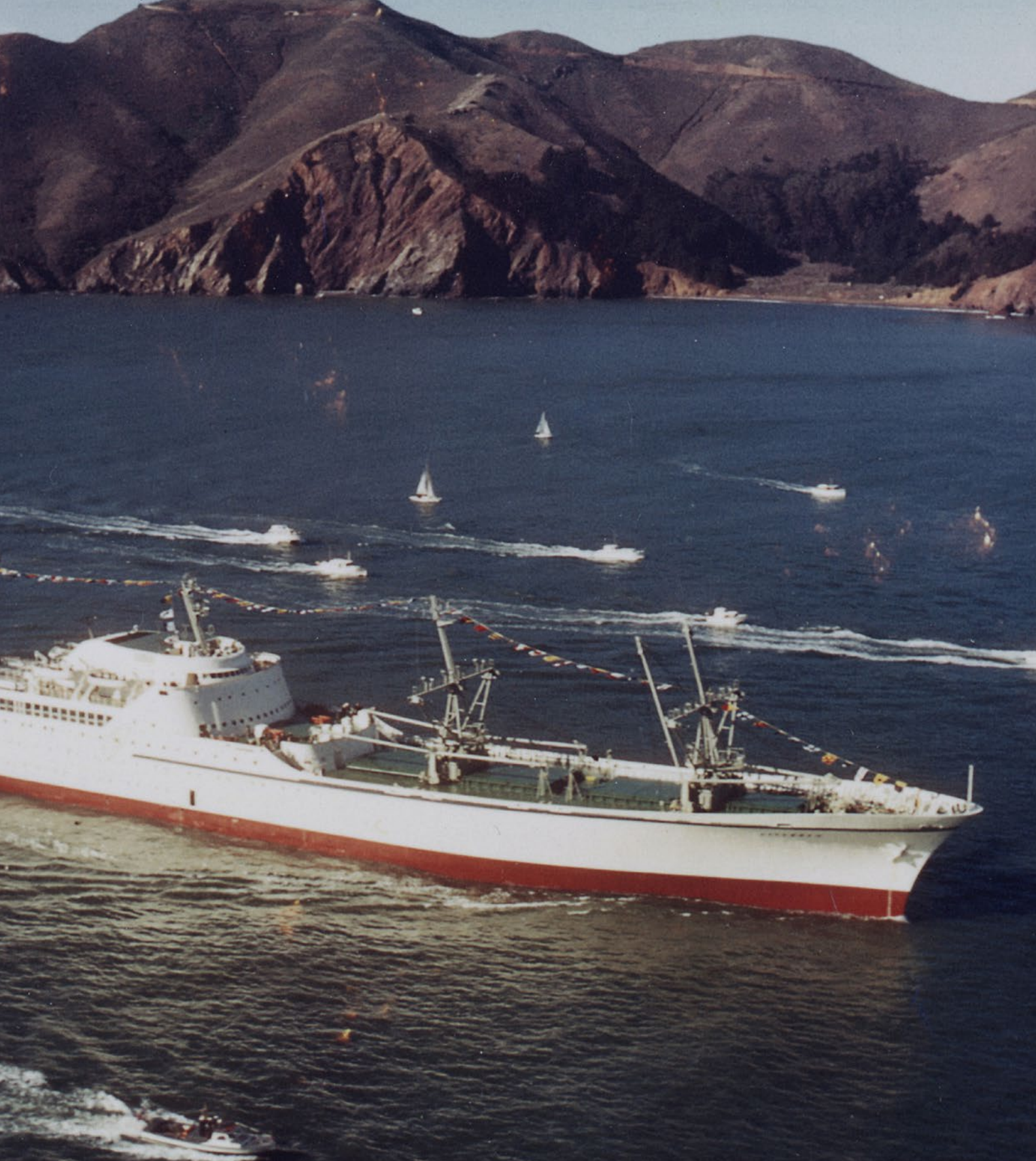
The nuclear ship Savannah on its way to the World's Fair in Seattle, Wash., in 1962.