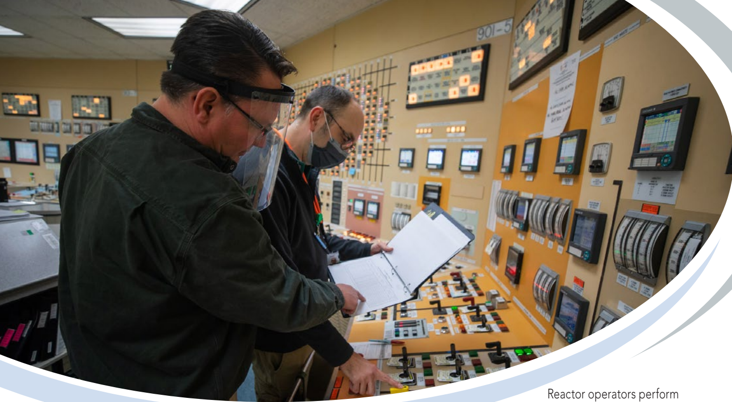
Reactor operators perform a surveillance during the 2021 outage.

exceptional equipment reliability organization, where we all support each other and make sure that we scrutinize the scope to ensure equipment reliability needs are met first and outage goals are balanced. When I started, you had to have a compelling reason as to why something needed to be added to outage scope. Now, if there's some issue out in the plant, it will be added to our outage scope unless it's something that isn't a current threat to the operation of the plant.