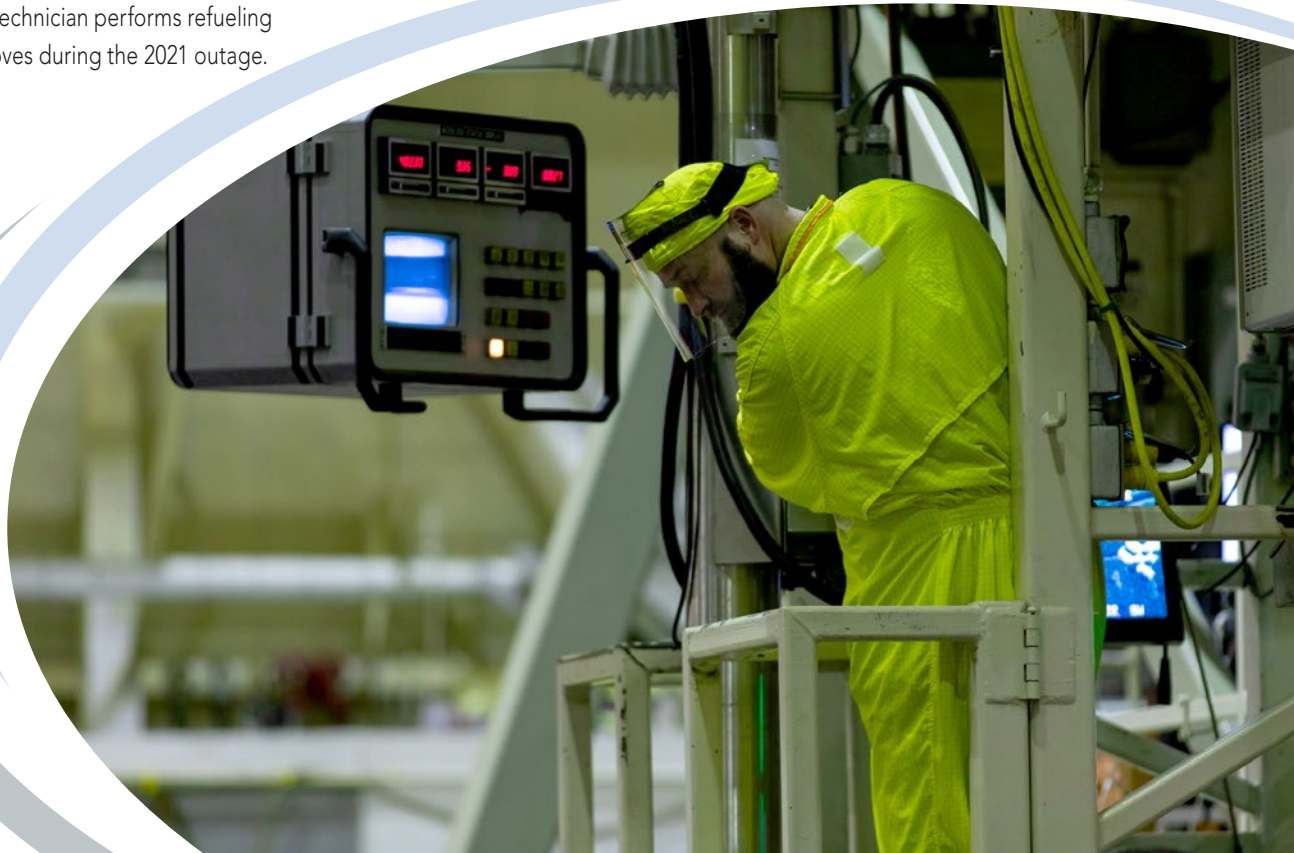
A technician performs refueling moves during the 2021 outage.