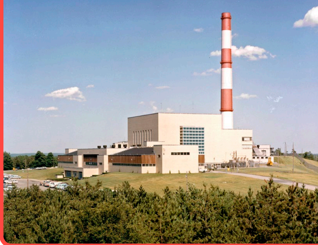
The Brookhaven Graphite Research Reactor with the iconic exhaust stack it shared with the lab's High Flux Beam Reactor in the background before the stack was demolished.

In providing tangible, real-world solutions for some of the nation's toughest challenges, the U.S. Army Corps of Engineers, New York District, continues to demonstrate its unique engineering and construction capabilities. The latest example involves the Brookhaven National Laboratory on Long Island, N.Y.