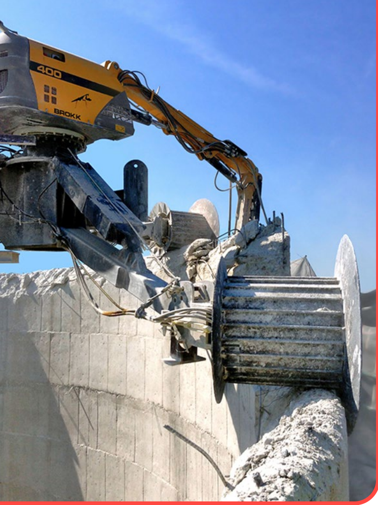
Above: An example of the MANTIS system being used at a stack demolition project outside of Brookhaven.

Additional safety measures were put in place to protect workers and the surrounding environment. Water sprayers were installed on the MANTIS equipment and at the bottom of the stack to suppress dust from the concrete. In addition, air samples were continually monitored to make sure there were no contaminants in the work area, and silt fencing was set up around the work area to prevent any contaminated water from running off the site.