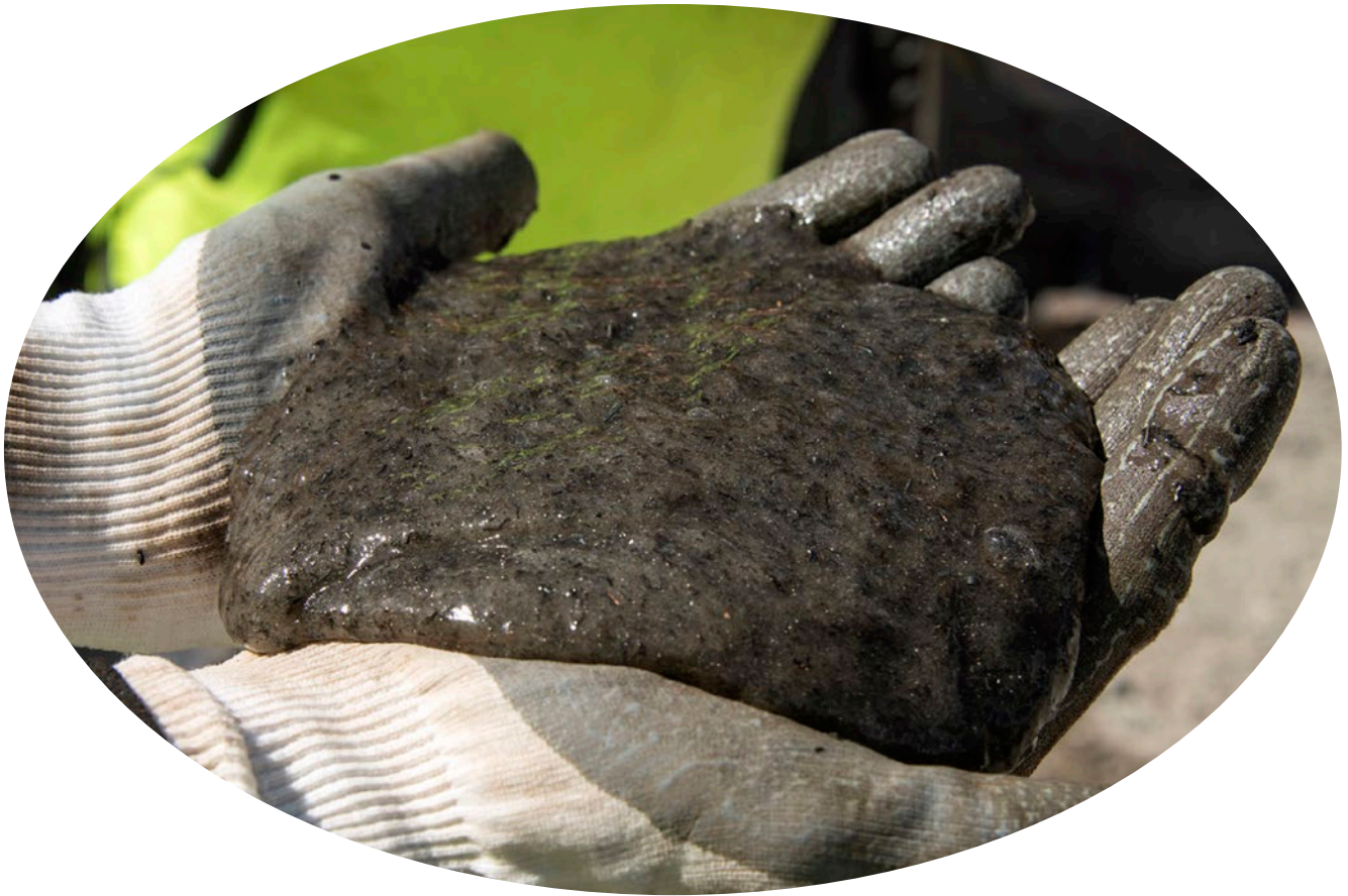
SRNS workers mixed more than 1.5 million pounds of iron filings with a food-grade, starch-like material, shown here.

To create the wall, SRNS subcontractors mixed large amounts of a food-grade, starch-like material with 1.5 million pounds of iron filings, which are ground-up iron parts from reclaimed automobile engines. The workers then injected the material into 22 wells, 12 feet apart, within the aquifer. The high-pressure injection creates fractures in the subsurface sediment, creating space to be filled by the mixture.