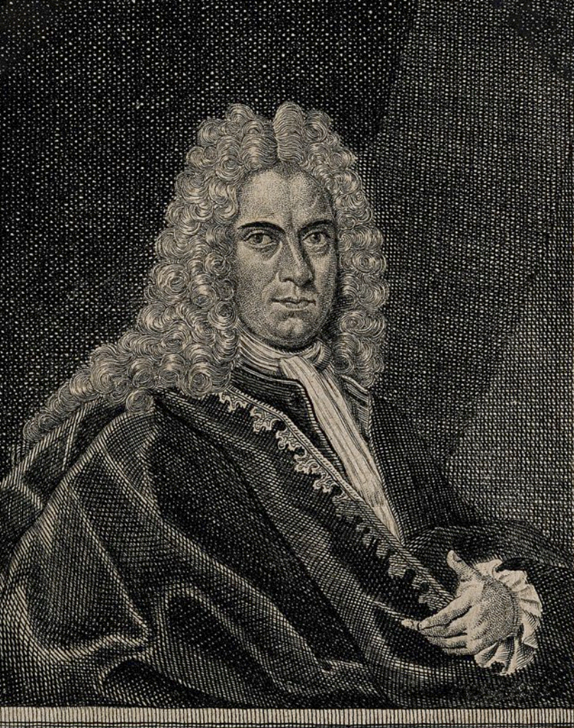
JO. HENRICVS SCHVLZE Colbicensis - Magdeburgicus Anatomiae et Chirurgiae Prof. Publ. in Academia Altdorfina ab A o 1720. Acad. Imperiat. Nat. Curios. Collega Almaeon dictus. Natus d. 12. May A o 1687.

FACTOID: German chemist Johann Schulze (1687–1744) is credited with laying the foundation for photography.