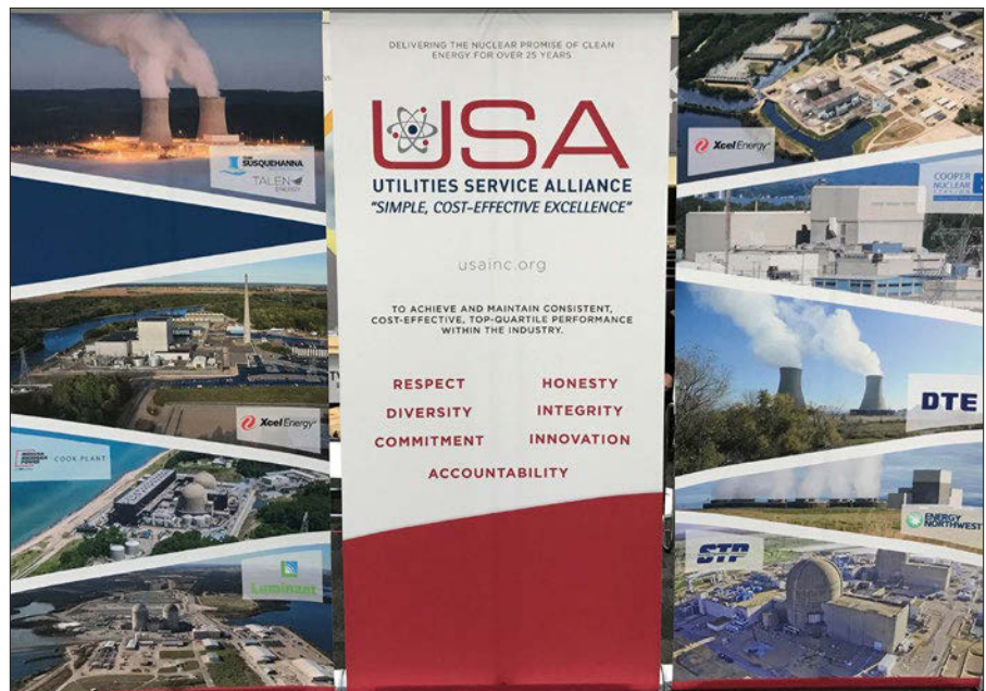
The Utilities Service Alliance's organizational banners.