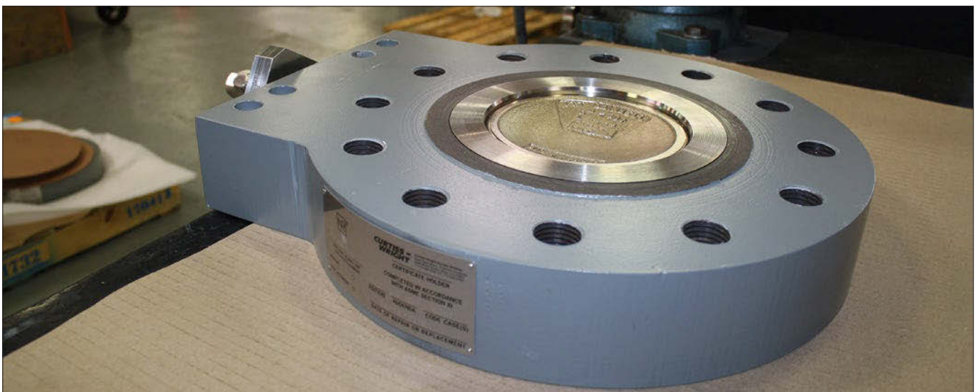
Top left: As found body. Top right: As found valve disc. Bottom: Finished valve body and disc.