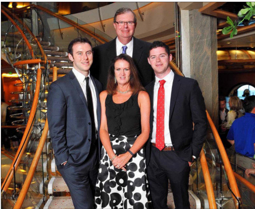
The Kray family on a cruise in 2015.