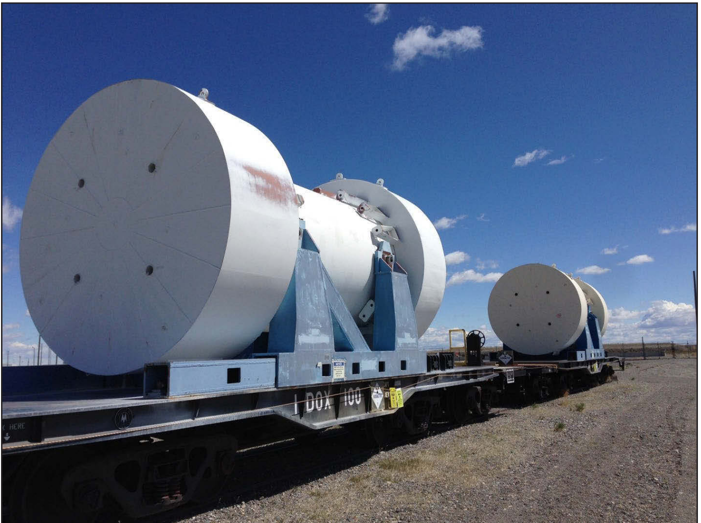
Transportation casks are designed to protect spent nuclear fuel during shipment by rail. New cask designs may be needed for transporting some commercial and DOE-managed spent fuel.