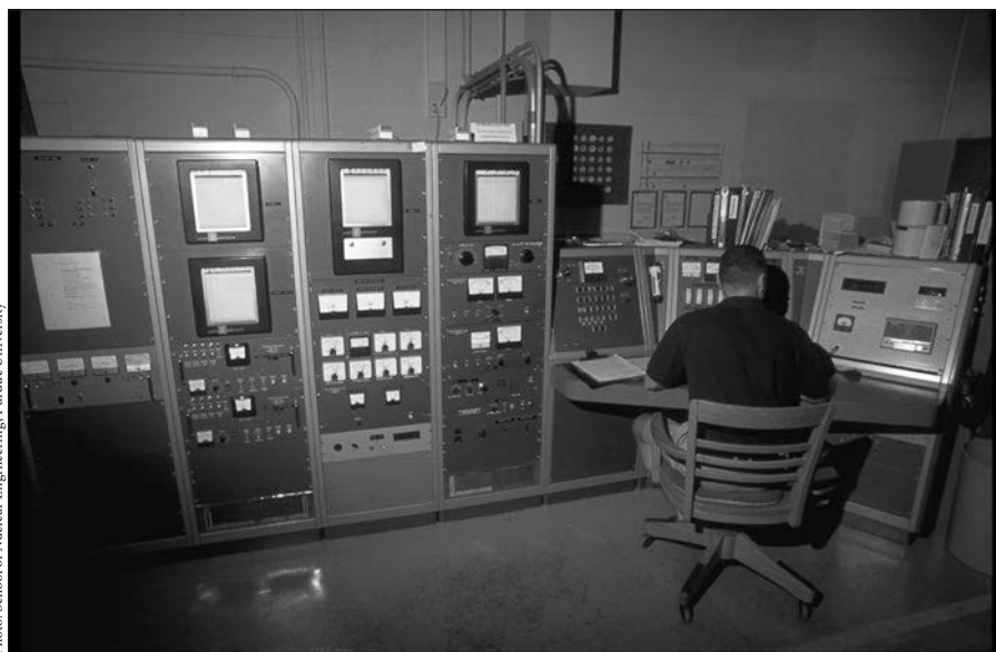
Historic operations at PUR-1, measuring early operational characteristics.

a “like-for-like” replacement, easing the regulatory burden (under 10 CFR 50.59) and staff effort to approve and install. These systems are the workhorses of current reactor control electronics, and there was no doubt that they would allow the reactor to operate safely and maintain reliability for many years.