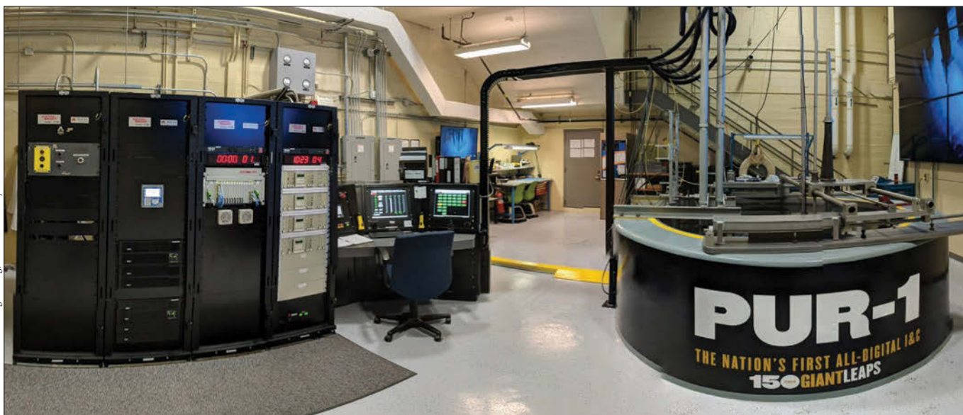
The new PUR-1 control console with fully digital safety and control systems, to be commissioned in 2019.