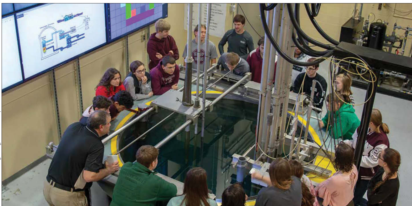
Outreach and engagement remain central components of the mission of PUR-1 and Purdue University.