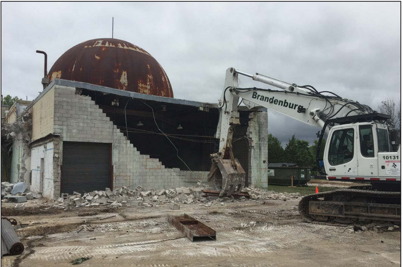
EnergySolutions' contract was modified in 2017 to incorporate further work that was supported by additional funding granted to UA. The second phase consisted of deconstruction of the operations and reactor support buildings, with additional efforts to characterize the reactor internals and complete passivation of all sodium waste in the primary system. Phase 2 work was completed in September 2017 and only the containment building remains.