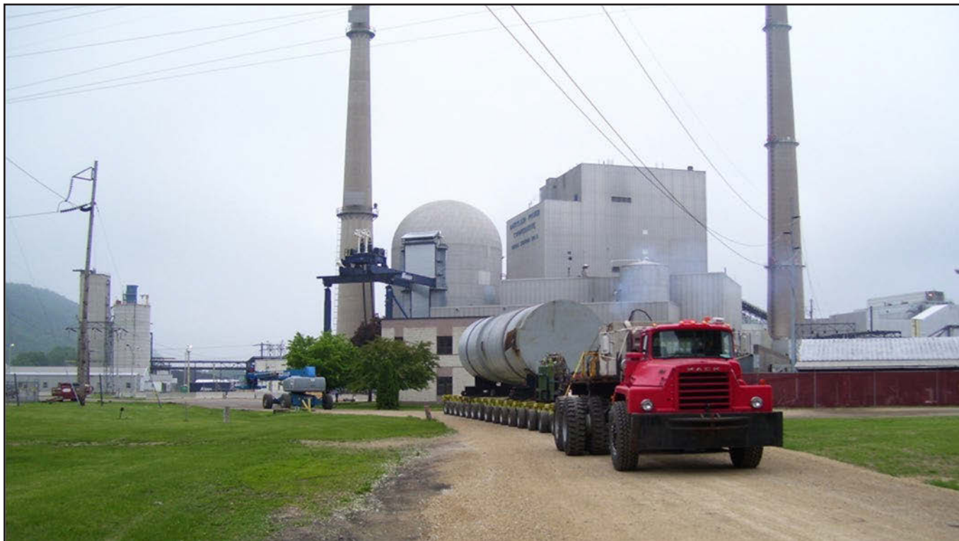
A key decommissioning activity occurred in 2007 when Dairyland Power Cooperative contracted with EnergySolutions to facilitate the removal, transportation, and disposal of LACBWR's reactor pressure vessel to the Barnwell disposal facility in South Carolina.