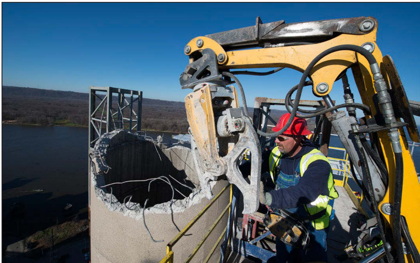
In 2016, EnergySolutions took operational control of LACBWR, allowing the company—as the 10 CFR Part 50 licensee—to continue expedited decommissioning activities at the plant. Demolition of LACBWR is expected to be completed in 2018. Removal of the plant's 350-foot-tall ventilation stack took about 150 days.