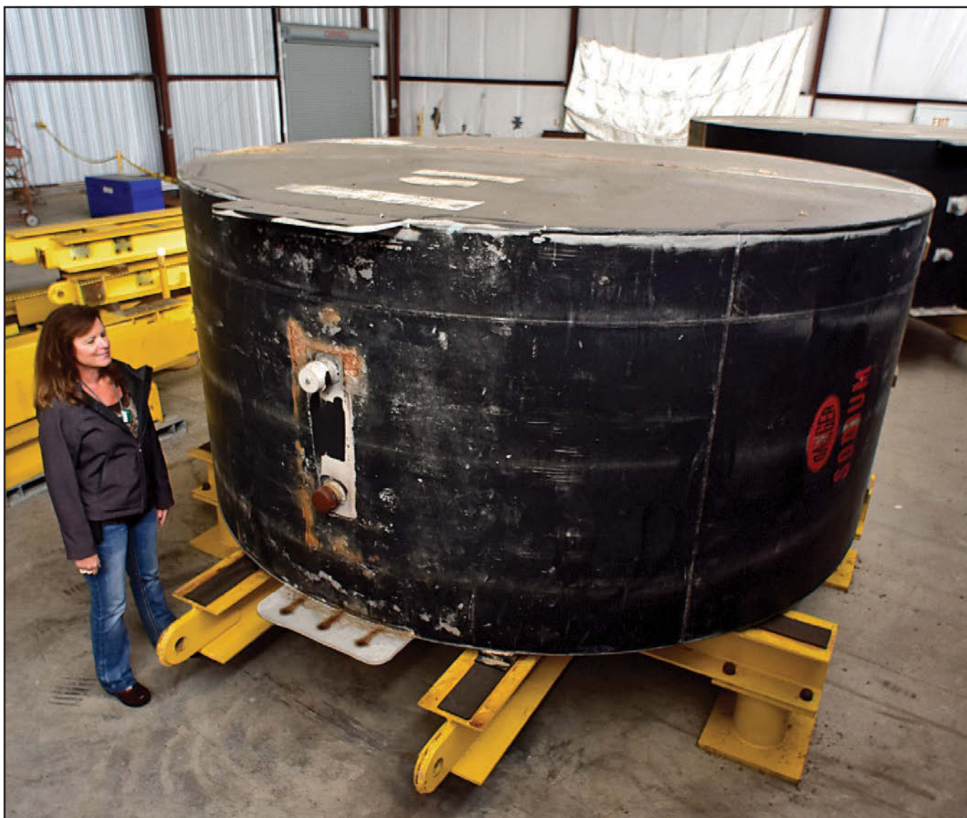
A sodium shield at Oak Ridge's ETPP awaits disposition.

but it is a small amount. Approximately 95 percent of the volume of cleanup waste on the Oak Ridge Reservation is stored on-site, while only about 5 percent has been disposed of off-site. At the same time, only about 15 percent of the radioactive curie content has been disposed of on-site, while 85 percent is being disposed of off-site.