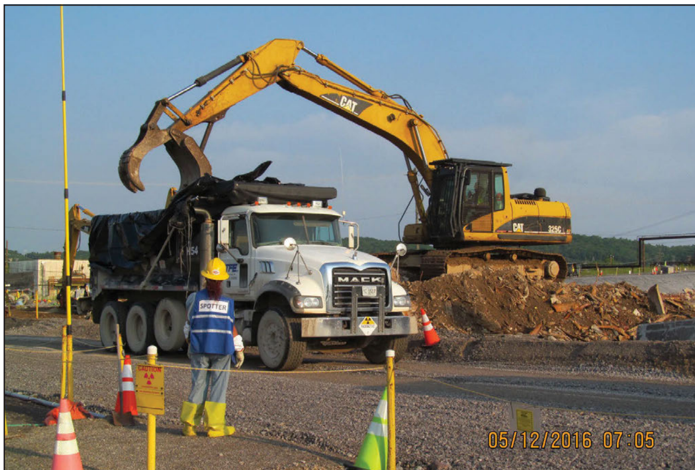
A truck is loaded with demolition debris for transfer to Oak Ridge's EMWMF.