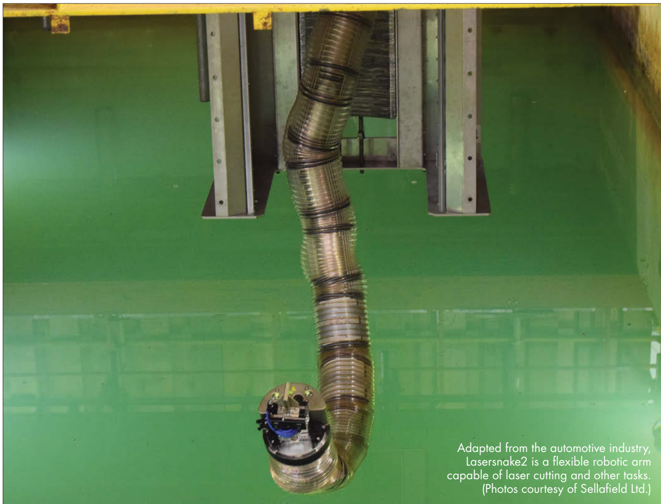
Adapted from the automotive industry, Lasersnake2 is a flexible robotic arm capable of laser cutting and other tasks.