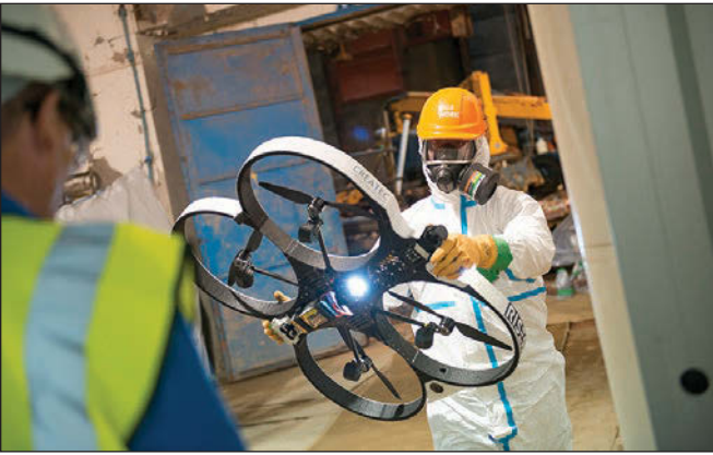
The RISER drone was tested as a characterization tool inside Sellafield's iconic Windscale pile chimney.

generates an accurate 3-D virtual model of the environment and will then overlay that model with accurate radiometric data. The first-ever test of the RISER in a radioactive environment took place this year inside the Windscale pile chimney on the site.