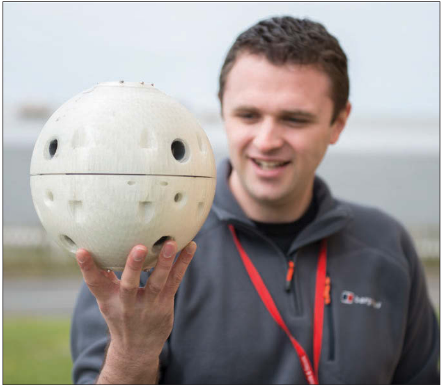
A small underwater ROV, AVEXIS-Mini can be produced through additive manufacturing, which speeds up production and reduces costs.

According to Sellafield Ltd., the next stage of the project will see Lasersnake2 tested in its first-generation reprocessing plant, where it will be used to size-reduce a lightly contaminated vessel.