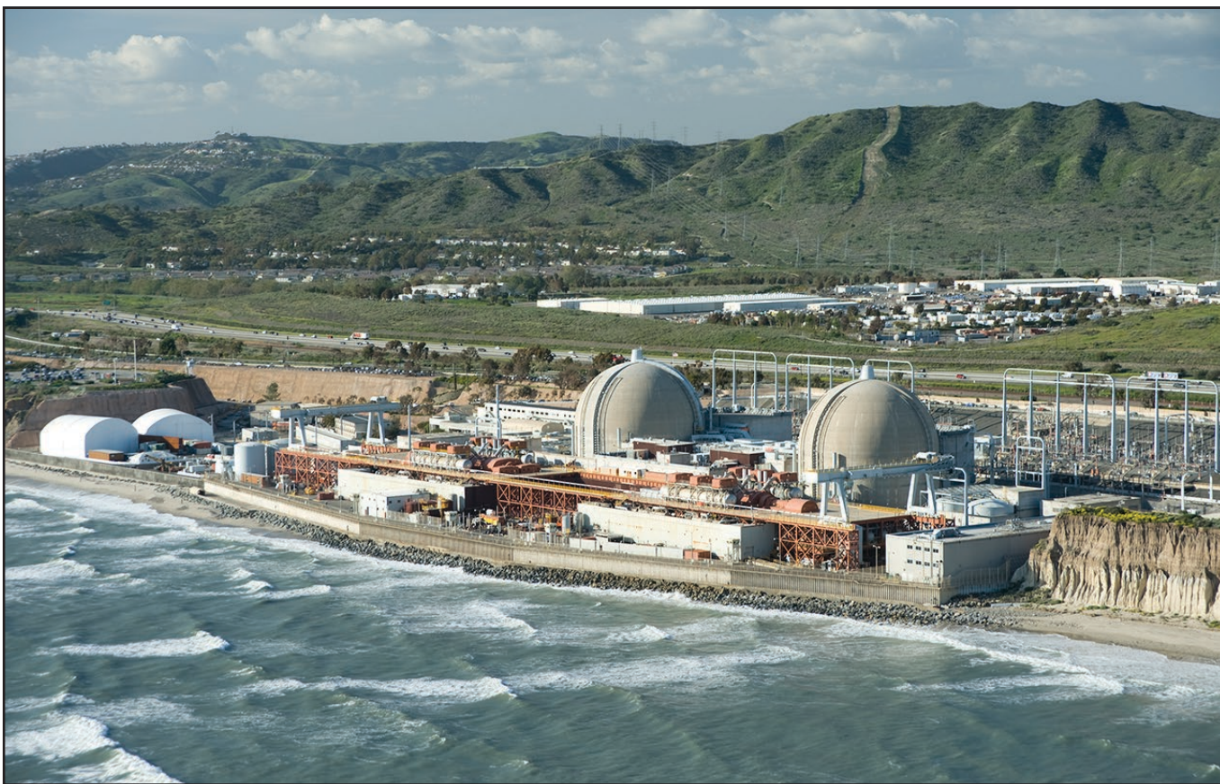
The San Onofre Nuclear Generating Station permanently ceased operations in 2013, and Southern California Edison intends to complete decommissioning within 20 years.