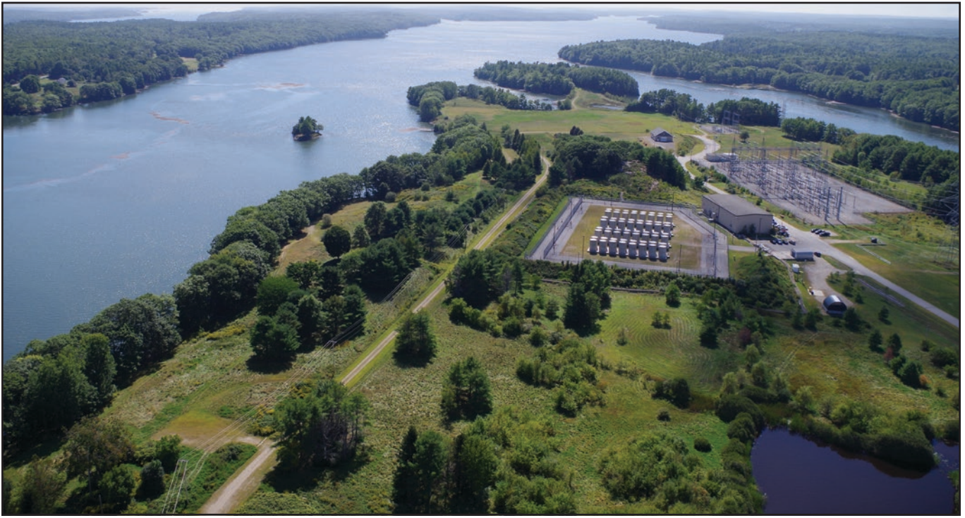
The nuclear industry has demonstrated that it can successfully dismantle nuclear power reactors, such as the Maine Yankee site, shown here following the completion of decommissioning work in 2005.