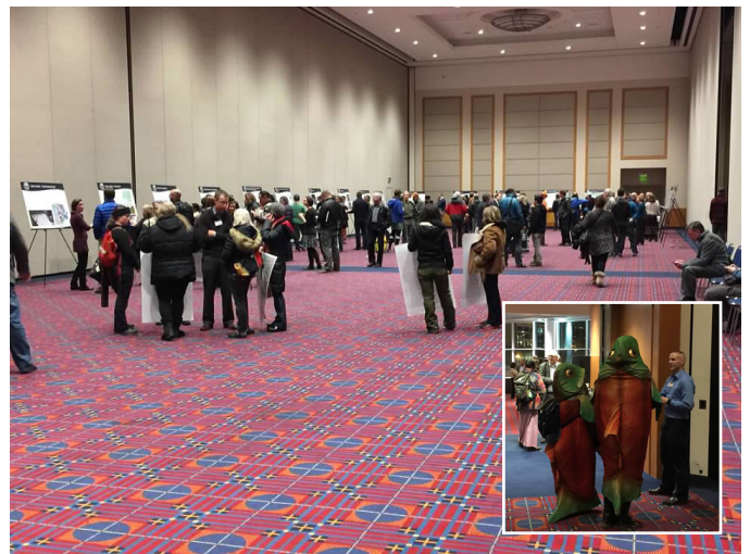
A public meeting in Portland, Oregon – coordinated by PNNL for the Bonneville Power Administration – brought strong attendance for required outreach about hydroelectric dam operations.

PNNL works with federal agencies to conduct complex environmental reviews and produce scientifically credible, legally defensible, and consistently useful National Environmental Policy Act (NEPA) documents for the public and government decision makers. Years of working with the U.S. Department of Energy (DOE), U.S. Nuclear Regulatory Commission (NRC), U.S. Department of Defense, and other agencies have provided PNNL with a broad perspective on the