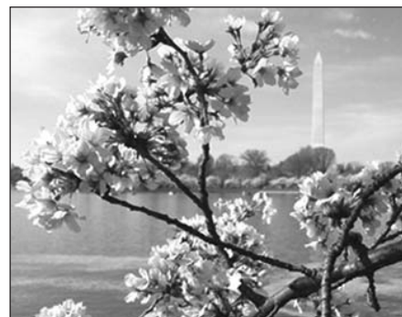
2009 ANS Winter Meeting • Washington, D.C.

The opportunity to meet other professionals and discuss issues with recognized authorities will enrich your professional development.