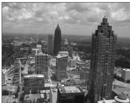
2009 ANS Annual Meeting • Atlanta, Georgia