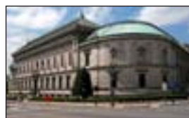
Corcoran Gallery of Art

Tonight, guests will experience an exciting and creative evening at the Corcoran Gallery of Art.