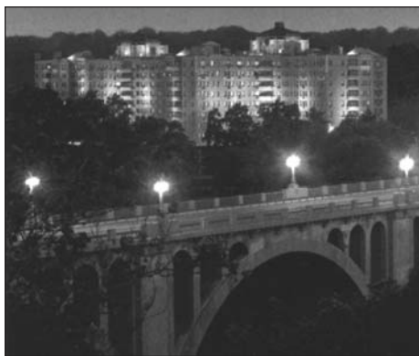
Omni Shoreham Hotel

The 2007 ANS/ENS International Meeting will be held November 11-15, 2007, in Washington, DC. There will be a Professional Development Workshop held in conjunction with the 2007 ANS/ENS International Meeting: “TMI-2: A Textbook in Severe Accident Management (A Severe Accident Primer for Young Engineers),” as well as the ANS Nuclear Technology Expo.