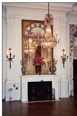
Inside the Washington Club