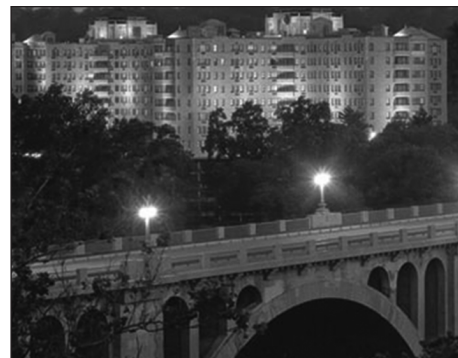
2011 ANS Winter Meeting • Washington, D.C.

The opportunity to meet other professionals and discuss issues with recognized authorities will enrich your professional development.