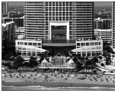
2011 ANS Annual Meeting • Hollywood, Florida