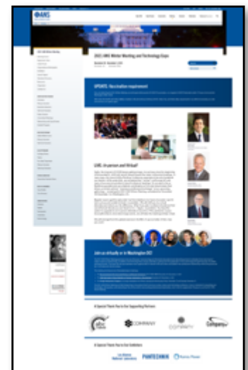
YOUR ORGANIZATION'S LOGO OR NAME AND BANNER ON OUR WEBSITE.