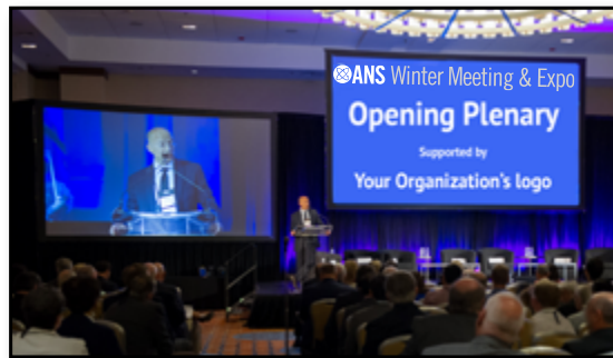
YOUR ORGANIZATION'S VIDEO AT START OF A PLENARY SESSION