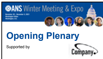
YOUR COMPANY LOGO OR NAME RECOGNITION DISPLAYED BEFORE A VIRTUAL PLENARY