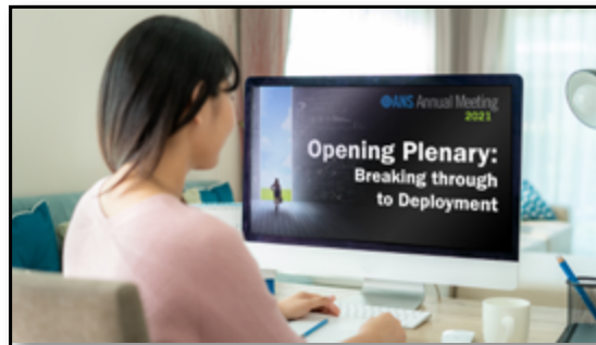
YOUR ORGANIZATION'S VIDEO AT START OF A PLENARY SESSION