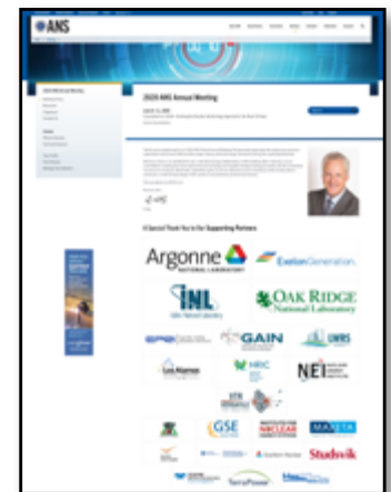
YOUR ORGANIZATION'S LOGO AND BANNER ON OUR WEBSITE.