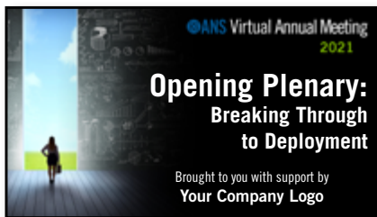
YOUR COMPANY LOGO RECOGNITION DISPLAYED BEFORE A VIRTUAL PLENARY