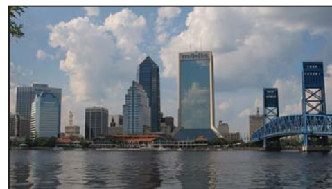
(Above) Jacksonville's skyline and the Main Street Bridge viewed from the southbank of the St. Johns River.