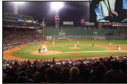
Fenway Park is home to the Boston Redsox.