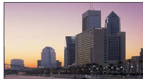
(Top left photo) Inside one of the many ballrooms of the Hyatt Regency Jacksonville Riverfront Hotel. (Photo above) The Jacksonville Hyatt is located along the banks of the St. Johns River and is in the heart of Jacksonville's business district.

One ticket is included in the full conference registration fee. You can purchase additional tickets at the Conference Registration desk for $45.00.