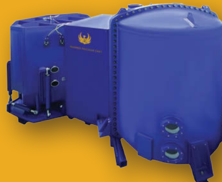
Neutron Generator with Custom Moderator

Capabilities formerly available only with a nuclear reactor or a radioactive source are now possible in-house with a PNL neutron generator. At PNL, we're providing nuclear technology for the betterment of humanity.