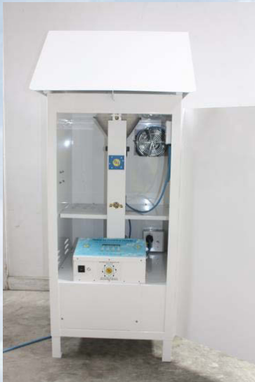
GAS-60810DT Series Ambient Air Monitoring System