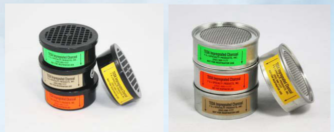
Radioiodine Collection Filter Cartridges

Tel: 352.680.1177 / Fax: 352.680.1454 / fandj@fjspecialty.com / www.fjspecialty.com