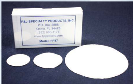
Filter Media MCE Membrane Assortment, Glass Fiber, Qualitative and Quantitative Media