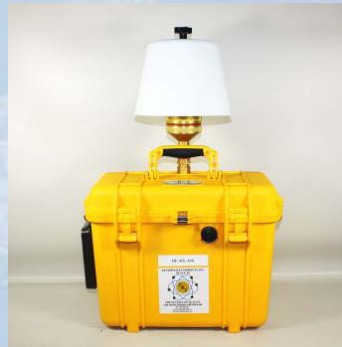
DF-40L-400 Emergency Response Air Sampler