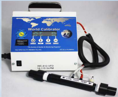
WC-VFD World Calibrator