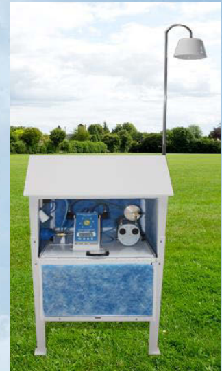
GAS-22 Low Volume REMP Air Sampler System