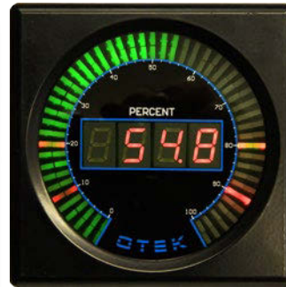
NTM-M 4" Switchboard 1 Channel Replaces DB40