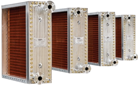
Motor Driven Pump Room Coolers

Cooling Coils & Components | Safety & Non-Safety Related