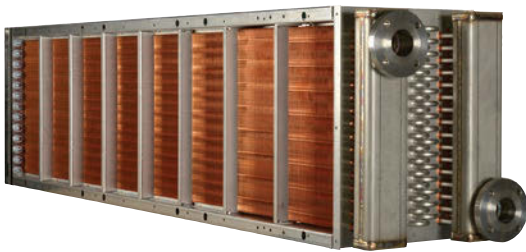
Containment Cooling Coil