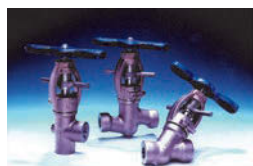
Clampseal® Globe and Check Valves

Ask around and talk to peers! Thousands of high-performance Conval valves are operating in nuclear power plants around the world.