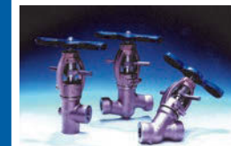
Clampseal® Globe, Gate and Check Valves