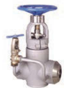
Swivdisc® Gate Valves

Ask around and talk to peers! Thousands of high-performance Conval valves are operating in nuclear power plants around the world.