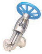
Bellows Seal Valves (high and low pressure)

Available for EPC new construction or MRO applications. Specify the proven nuclear valve leader!