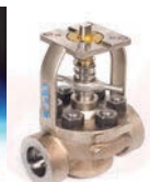
Camseal® Metal- Seated Ball Valves

Ask around and talk to peers! Thousands of high-performance Conval valves are operating in nuclear power plants around the world.