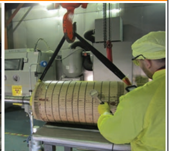
In-House Decon Facility