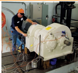
Gearbox Repair, Testing and Replacement