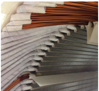
NUREG-0588 CAT-I (EQ) Insulation Systems