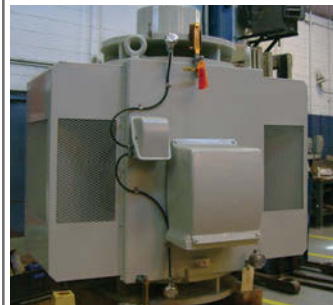
Safety-Related Motor Repair