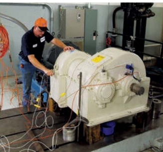
Gearbox Repair, Testing and Replacement