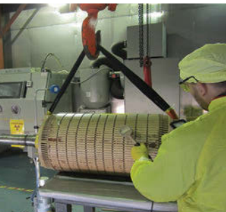
In-House Decon Facility