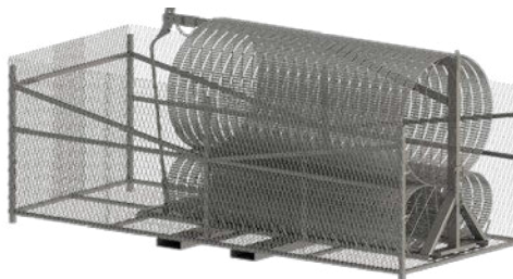
Razor Ribbon Rapid Deployment Unit shown inside the Razor Cage

The Razor Cage is a steel structure designed to protect open space equipment and is easily moved and deployed