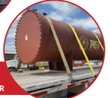
TEi COMPONENT COOLING WATER HEAT EXCHANGER