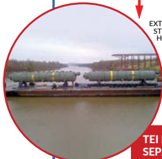
TEi MOISTURE SEPARATOR REHEATER