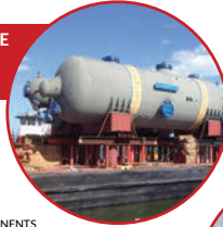
TEi MOISTURE SEPARATOR REHEATER