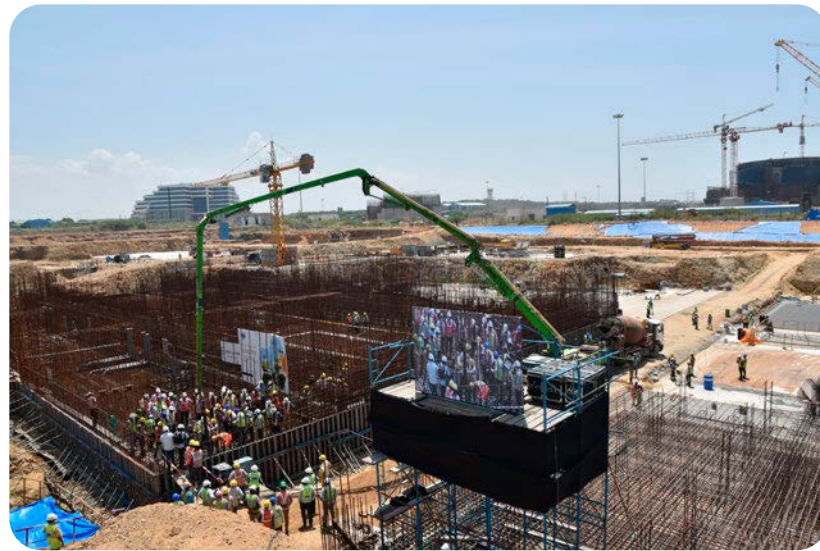
India's Kudankulam plant, during the June 29 Unit 5 construction launch ceremony.

release from Nuclearelectrica, the state-owned Romanian utility that operates Cernavoda. The projects would also contribute to the development of the internal supply chain, generate up to an additional 9,000 jobs, and stimulate research, innovation, and development in the nuclear industry, Nuclearelectrica said.