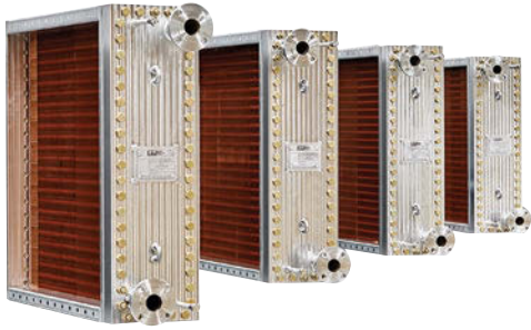
Motor Driven Pump Room Coolers

Cooling Coils & Components | Safety & Non-Safety Related