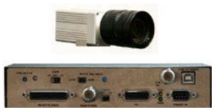
MegaRAD3 produce color or monochrome video up to 3 \times 10^6 rads total dose

With superior capabilities for operating in radiation environments, the MegaRAD cameras provide excellent image quality well beyond dose limitations of conventional cameras, and are well suited for radiation hardened imaging applications