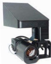
KiloRAD PTZ radiation resistant camera with Pan/Tilt/Zoom