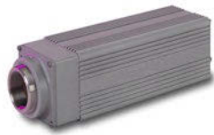
MegaRAD1 produce monochrome video up to 1 \times 10^6 rads total dose